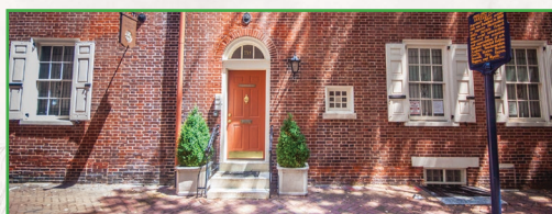
The Philadelphia Sketch Club 235 S Camac St, Philadelphia, PA 19107

experiment, make new friends, try new things, and maybe take a few aspiring artists under your wings. We believe that access to our roster of Creatives should be organic and enjoyable for Creatives and Artistatendees alike. We aim to facilitate this by placing everyone on equal ground and helping them explore new relationships and opportunities. We inspire each other by being ourselves with no pressure, no requirements, and a singular goal to have fun.