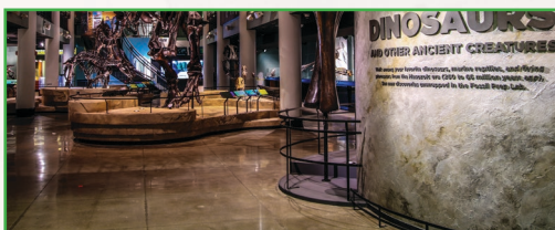
The Academy of Natural Sciences 20th St & The Pkwy Philadelphia, PA 19103