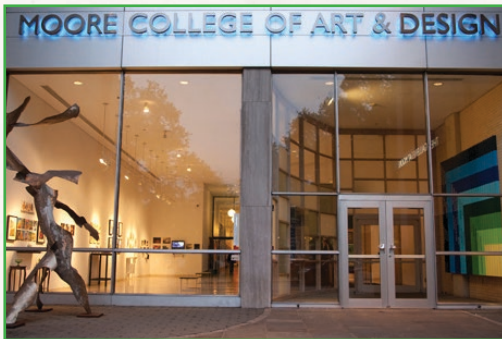
Moore College of Art and Design 20th St & The Pkwy Philadelphia, PA 19103